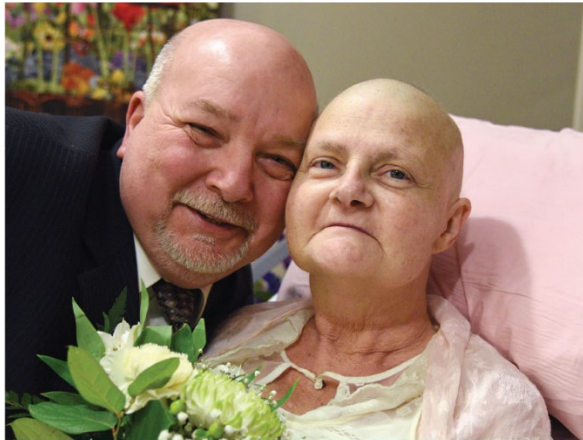
living well at HOSPICE

Care, compassion and dignity for people at end of life and their families.