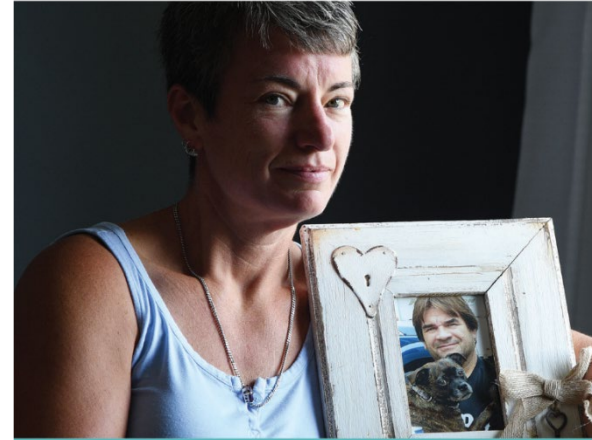
living well with GRIEF

Support for people throughout their illness, improving quality of life and well-being.