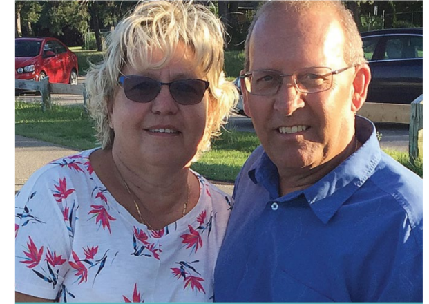
living well as a CAREGIVER

Children, youth and adults explore feelings of grief and loss, in a safe and supportive space.