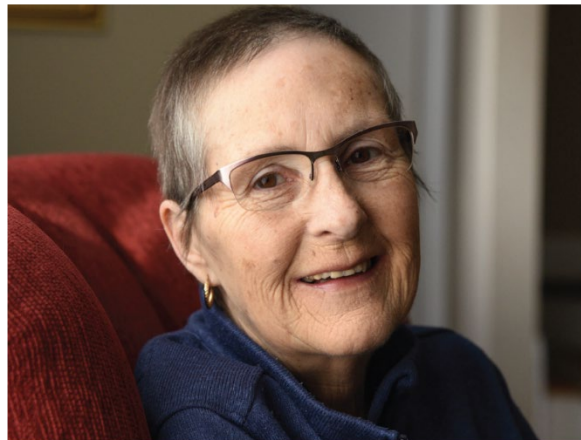
living well at HOME

Care, compassion and dignity for people at end of life and their families.