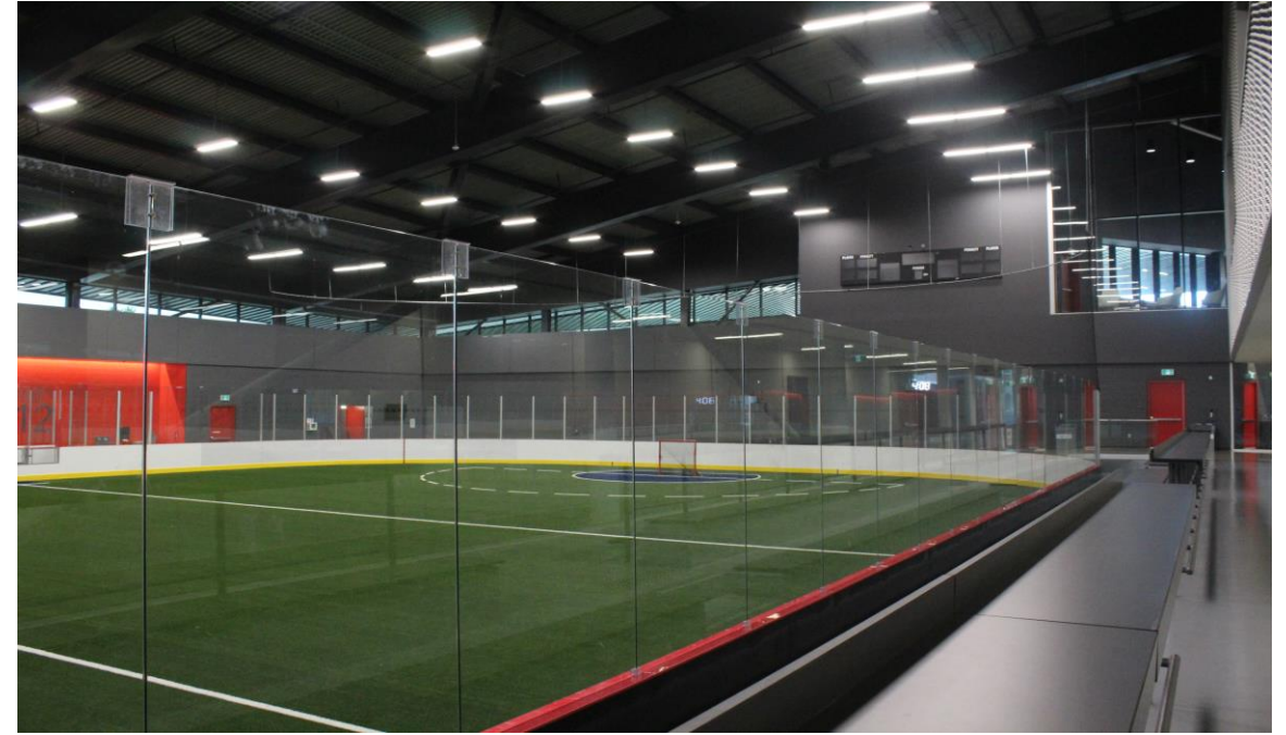
GFL Environmental Arena Seats 250 fans