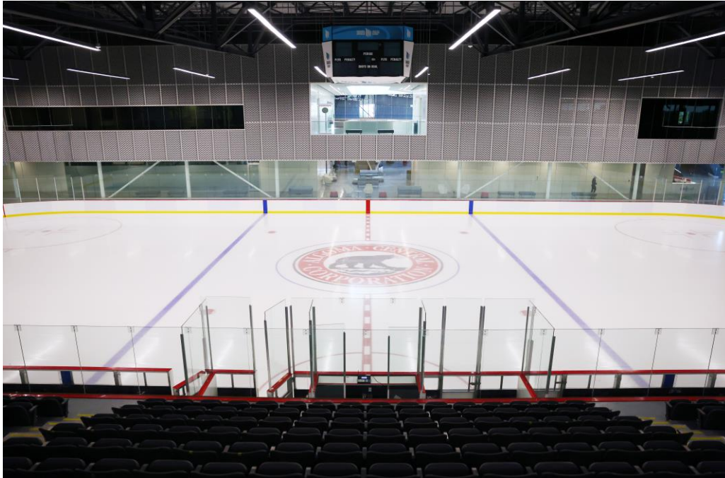
Algoma Central Corporation Arena Seats 1200 fans